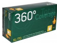
Disposable Vinyl Gloves