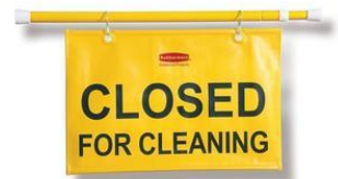
Hanging Closed for Cleaning Sign