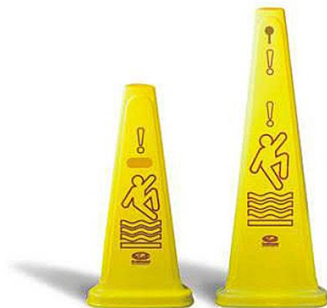
Safety Come Caution