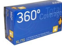
Disposable Nitrile Gloves