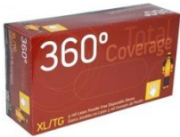
Disposable Latex Gloves