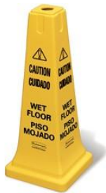
Safety Cone Wet Floor