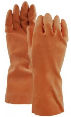
Orange Rubber Dish Gloves Flock Lined