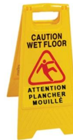
Wet Floor Sign